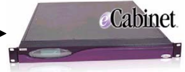
Store Indexed Image to eCabinet

Introducing Innovative Systems and Solutions Ltd.