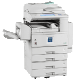
Scan to LAN Folder via MFP